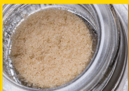
6 star full melt hash