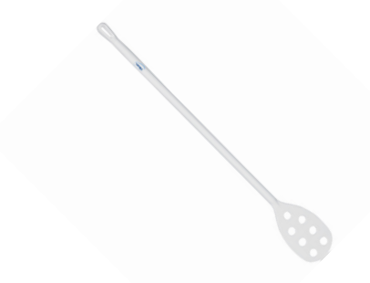
Polypropylene Hash Washing Paddle

Visit our online shop at www.purepressure.com for details and pricing.