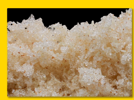
Full spectrum ice water hash

Bruteless™ vessels can make every type of ice water hash, including full melt or six star hash, which is sought after by connoisseurs the world over.