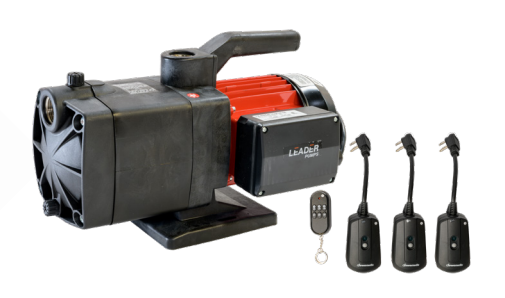
Bruteless Water Pump w/ Optional Remote Control